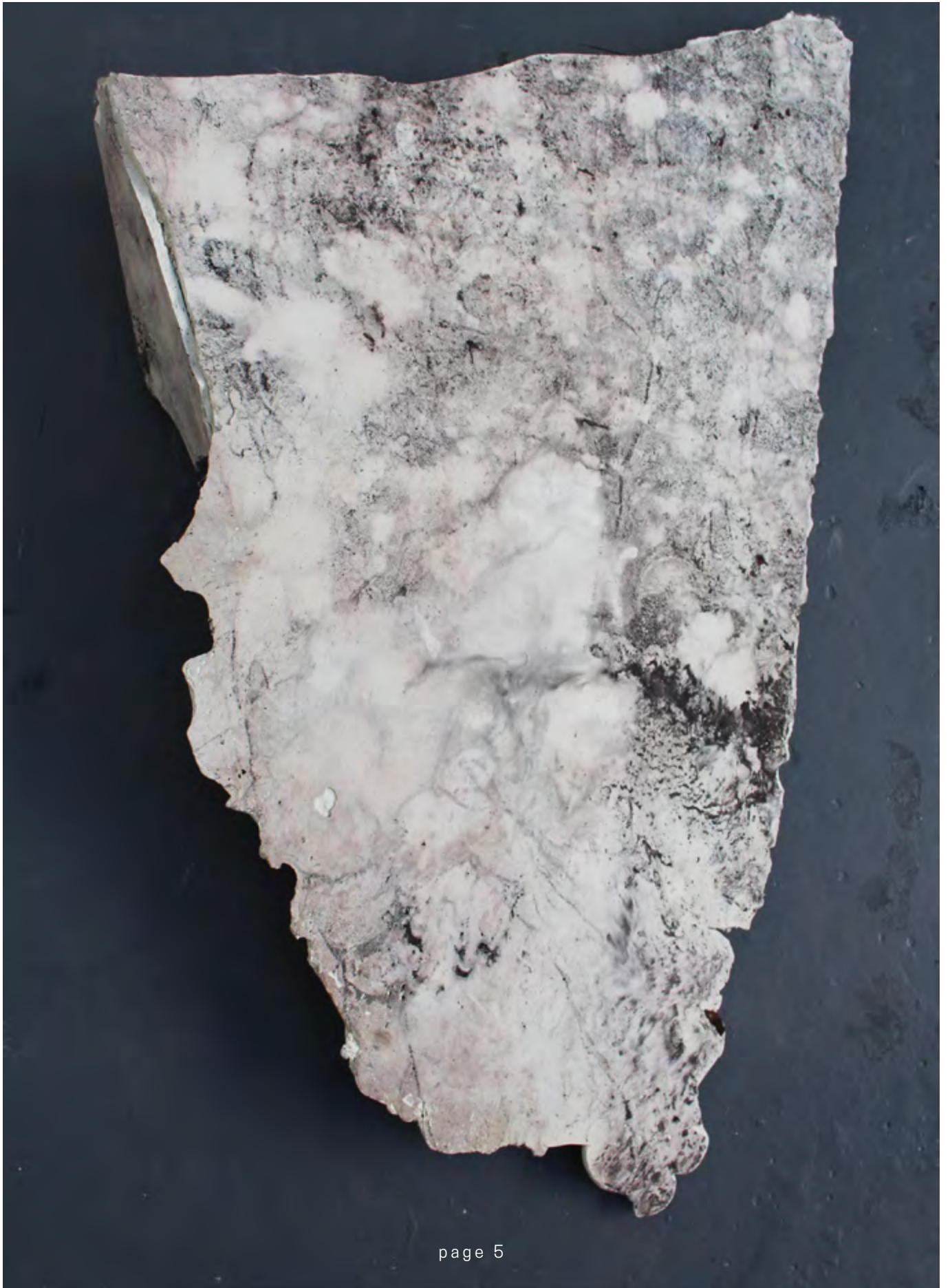
NE 5, studio view, Villa Belleville, Paris, 2018