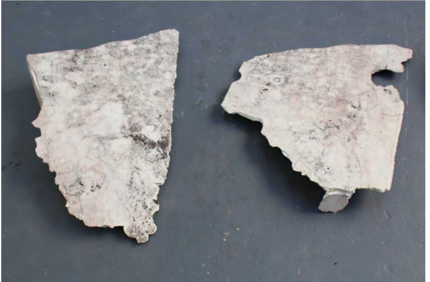
NE 5 and NE4, studio view, Villa Belleville, Paris, 2018