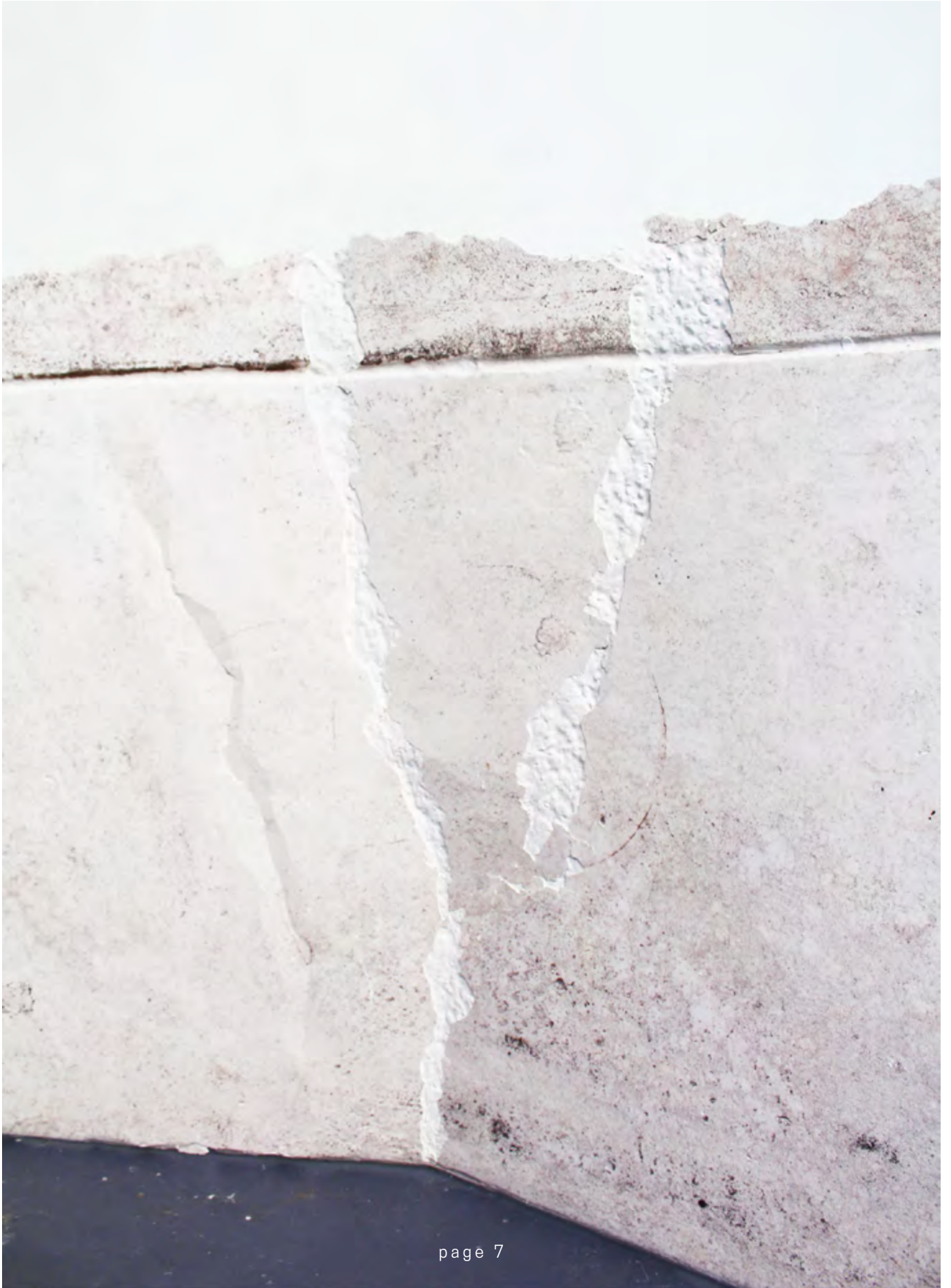
E6 (ROME), detail