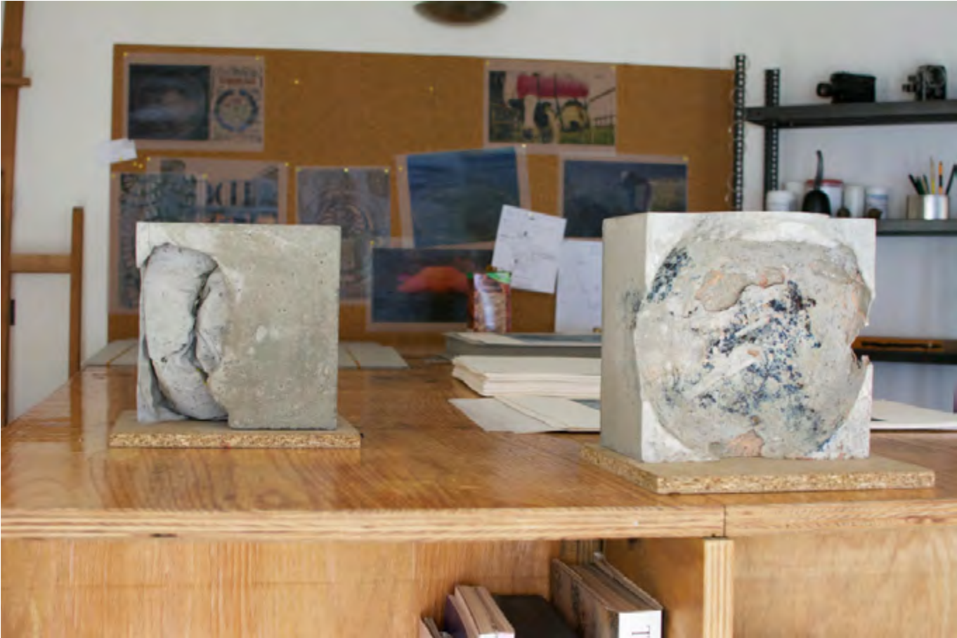
Studio view, Bikini Art Residency, Lac de Côme, 2017