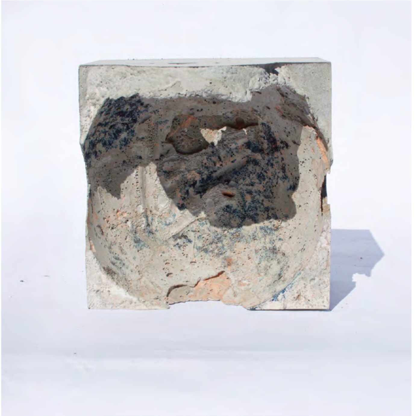
Beyond our control, 2017