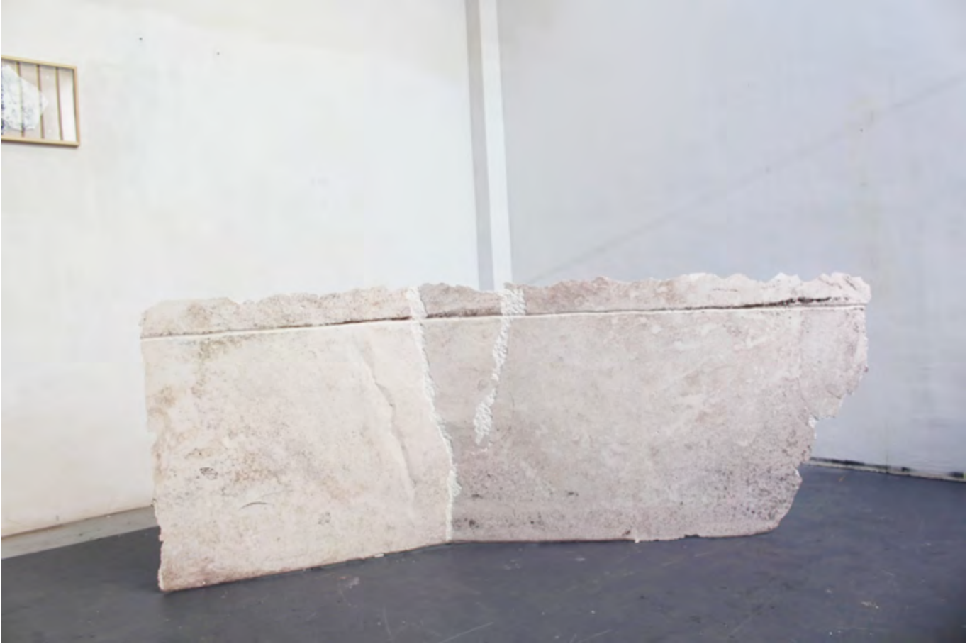
E6 (ROME), studio view, Villa Belleville, Paris, 2018