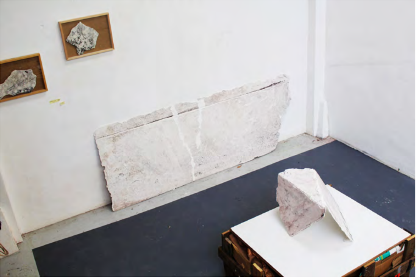
Studio view, Villa Belleville, Paris, 2018